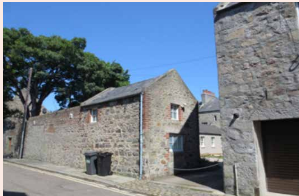
Original news building in Gordon Street now converted into a home as part of an entire feu redevelopment.