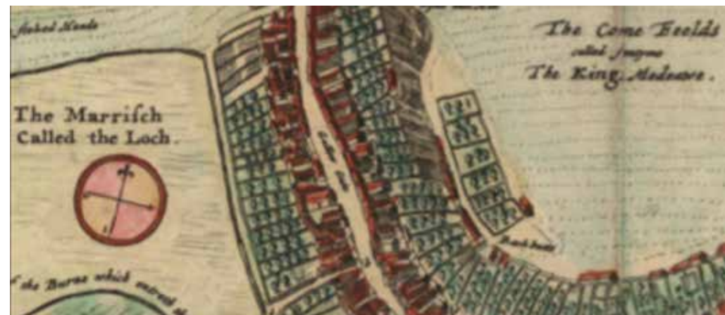
Extract from Parson Gordon's Map of Aberdeen 1634 showing lanes and mews off the Gallowgate area

1.3.1 Lanes have always been part of the urban development of Aberdeen as a necessary means of servicing a larger planned network and their use can be traced back to medieval times. In the Georgian period the planned urban environment was organised to reflect social hierarchies with people and uses segregated according to social class and use hierarchy. Historically, the grandest of properties would have the lane at the rear of the feu edged with a mews building, being two-storey and accommodating carriages, horses, general storage and sometimes with living accommodation above. Today there are remnants of mews buildings along Bon Accord Crescent Lane, Albyn Lane and Queens Lane North and South, however many have been lost to the demands of in-curtilage car parking. By the time the greater part of the West End was complete mews buildings were no longer required for their original purpose.