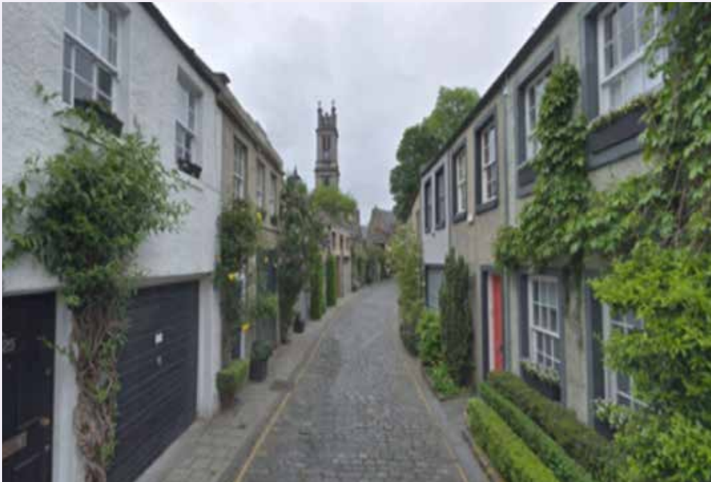
Historic mews in Stockbridge Edinburgh converted into attractive dwellings with minimal setback enabling some soft landscaping to enliven the lane