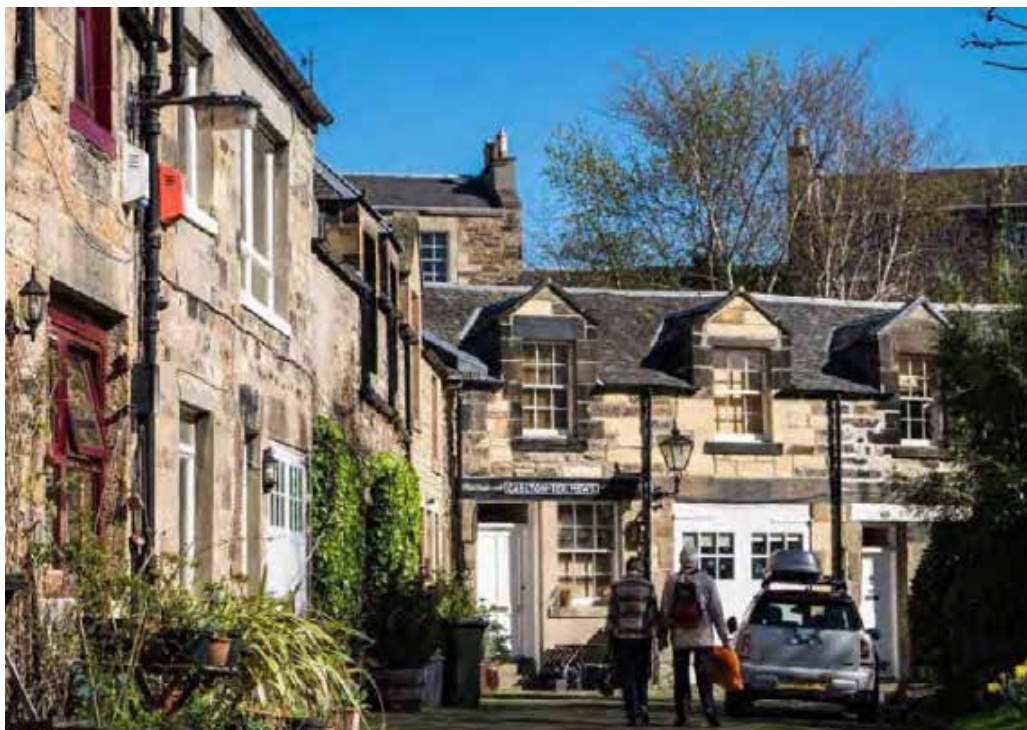
Calton Terrace Mews, Edinburgh, where the collection of mews around a shared central green gives the impression of a distinctive place and community

1.3.3 Mews buildings today, either as a reworked existing, or new building, remain as an appropriate form of small-scale development both within historic and newly planned areas. They offer the opportunity to have an attractive home close to amenities and whose form, of relatively small-scale living, gives an attractive contrast and diversity to the surrounding properties. When grouped together should foster a strong sense of community.