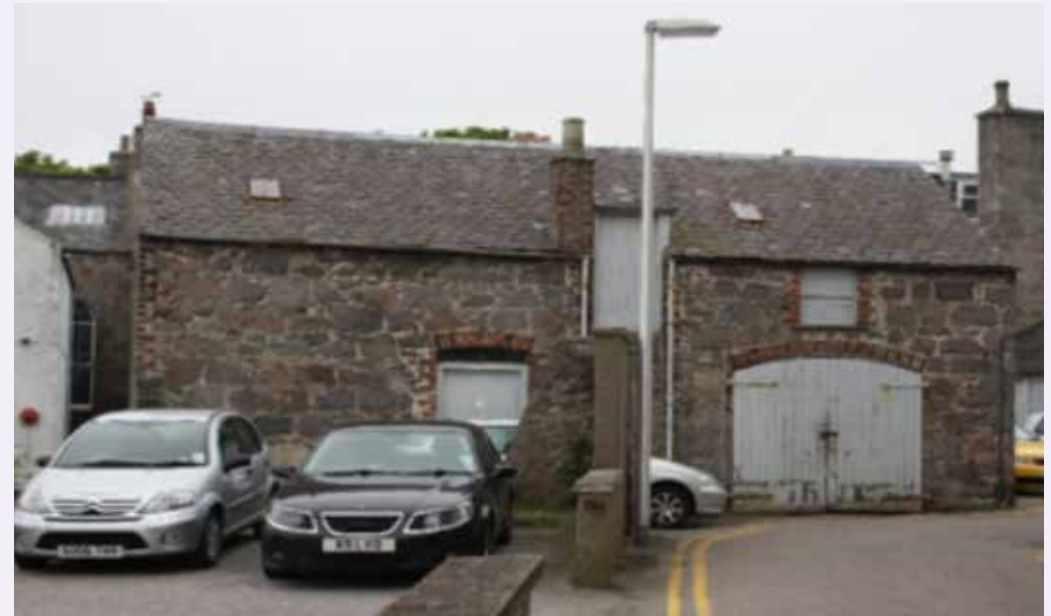
Original mews building on Bon Accord Cres Lane