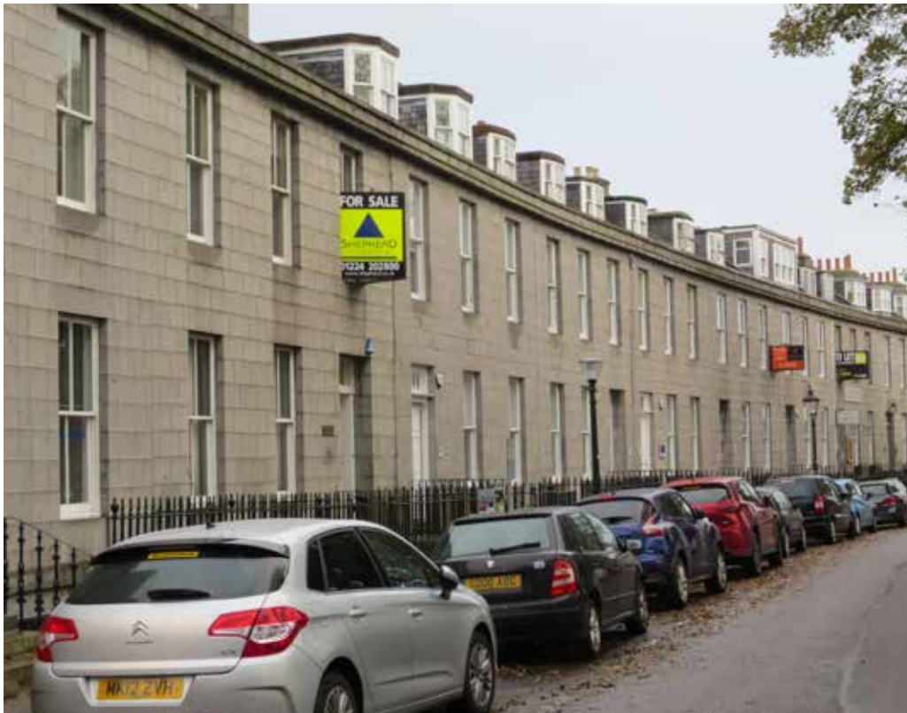
Bon Accord Crescent properties on the open market

This document provides parameters for development along established lanes within the City Centre , part of the Albyn Place / Rubislaw Conservation area , and for new development along lanes in new masterplanned areas (refer to map at Appendix 1) . The advice encourages the creation of residential mews buildings in specific areas, although the forms of development advocated may also be appropriate for a range of other uses, if in accordance with the Aberdeen Local Development Plan.