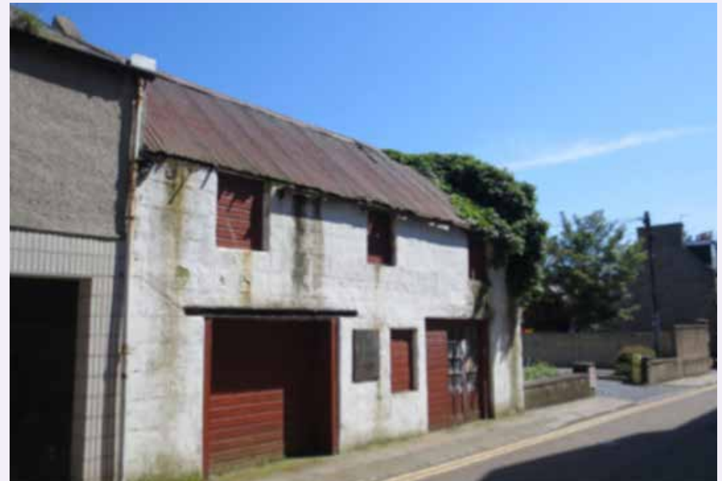
Original mews building on Gordon Street