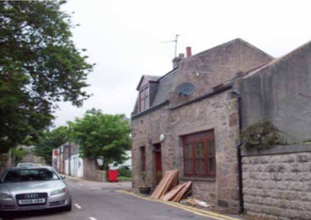
Residential mews buildings along Albyn Place Lane

2.5.3 Masterplan Zones – Sites within the Aberdeen Local Development Plan’s Masterplan Zones should consider in-curtilage car parking in the form of garaging integral to a mews development and with the garaging serving no more than the residence above in order that residential amenity is not compromised. The provision of garaging that serves nearby property will require robust justification.