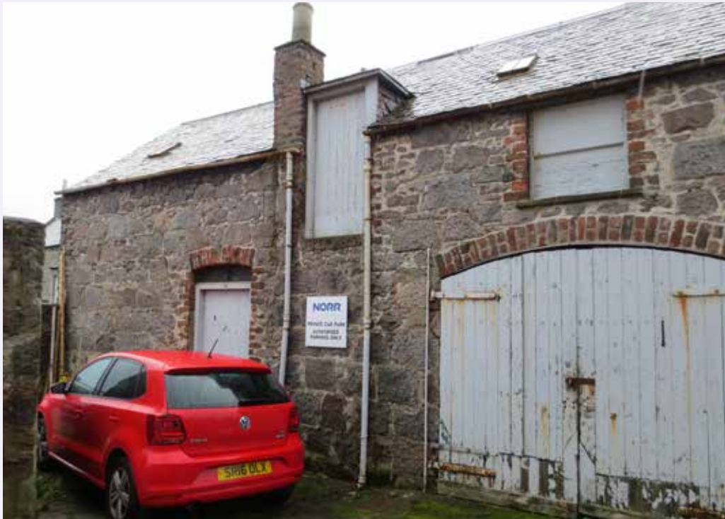
Original mews buildings on Bon Accord Crescent Lane