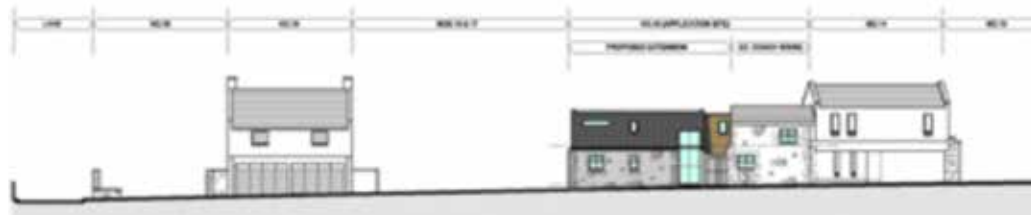
Examples of new mews building as part of the comprehensive redevelopment of 15 Bon Accord Crescent (Courtesy of Neil Rothnie Architects)