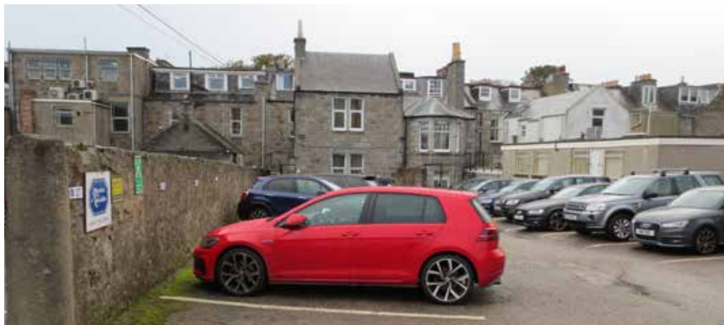
Bon Accord Crescent Lane boundaries removed to accommodate car parking

1.2.5 The parameters provided in this advice are also applicable to development along new lanes within masterplanned areas where lane characteristics should form part of a well-designed hierarchy of a place and movement network, and where a greater range of different dwelling types provides choice and improves whole-life options for the creation of sustainable communities.