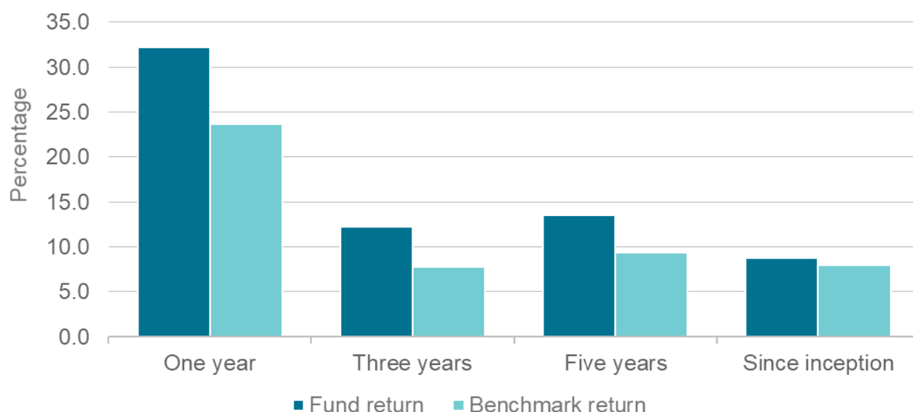
Exhibit 8 Fund investment performance