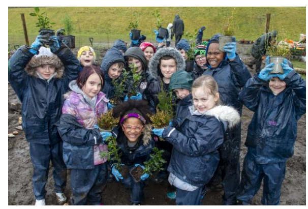
Woodside Primary's "Wee Foresters" in honour of The Queen's Platinum Jubilee.