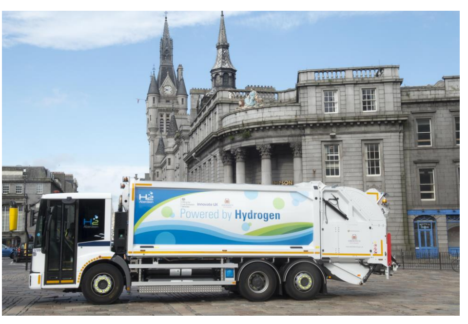
HECTOR pilot, part of the Fleet Replacement Programme.

8% of Council fleet is now low emission.