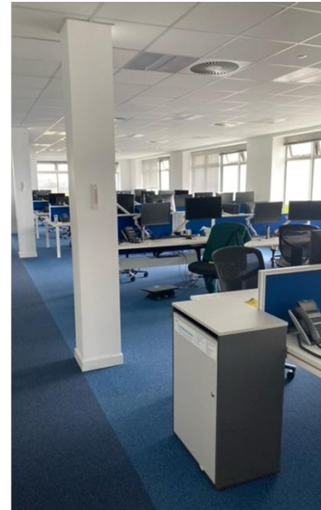
Altens offices post-fire – firewall did its job very well