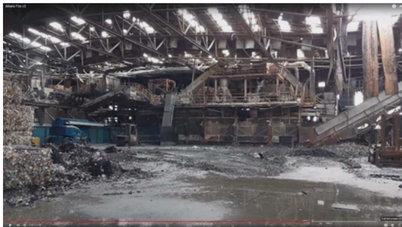
Inside MRF before and after fire