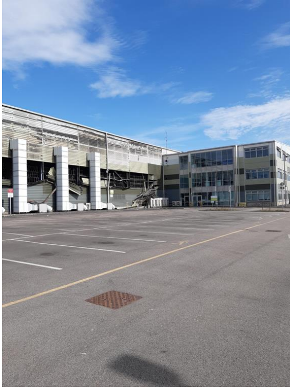
External photo, post fire.