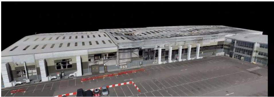
Overall site – note the condition of the RDF building on the left compared to the MRF building.