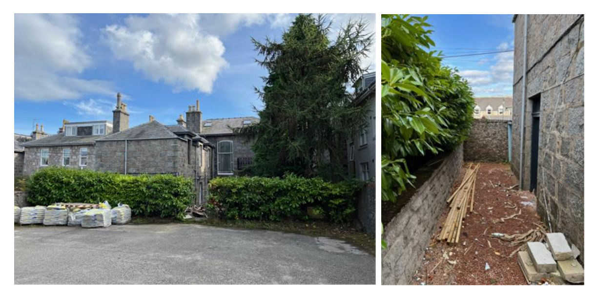
Figure 4 – Hedge to Southern Boundary

The site is approximately 486 sqm in area with existing high traditional walls to the east and west. These too are to remain. The existing poor quality office has no architectural merit, does not offer any benefit to the Conservation Area, and is proposed to be demolished and replaced with a high quality and modern new home. The car park is to become the garden for the house.