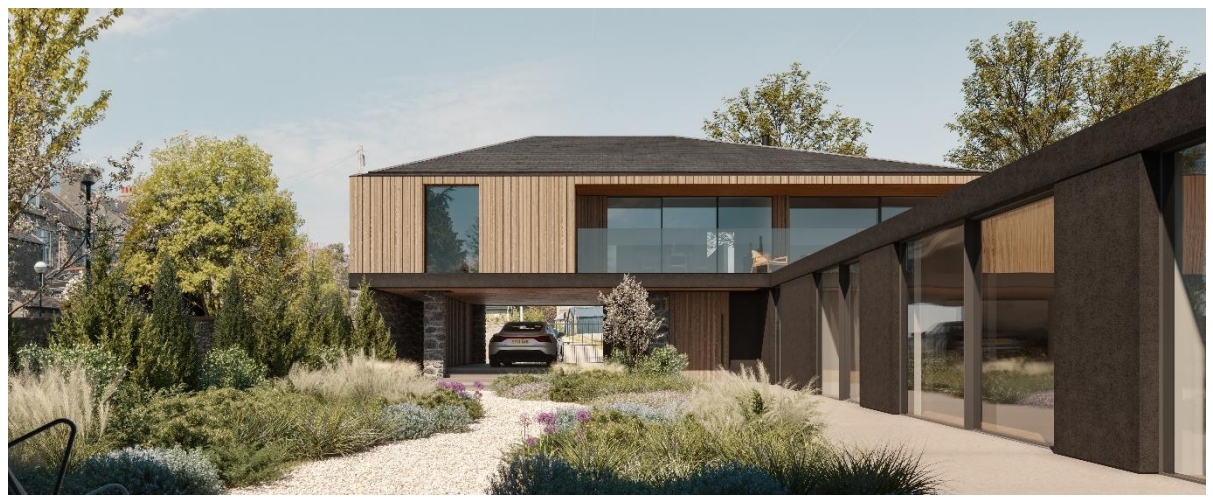
Figure 1 - Visual of Proposed House from the garden – Extract from Design Statement (Brown & Brown – Document AD15 )

The new house is 2-storeys to the lane with a single storey wing to the rear. The new home will enclose a large garden with the remaining three sides bound by the existing high stone walls and a new 1.8 metre wall to the rear to match. The hedge to the rear will remain and the single storey wing will include a green roof. Car parking is provided within the site (under the building). The rear garden has been designed to offer privacy and security and the house will provide a strong boundary to the lane. Application drawings are included in the Appeal Documents.