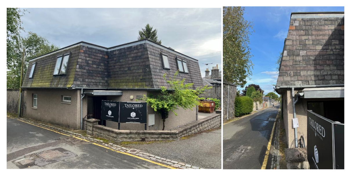
Figure 3 – Existing Office Building