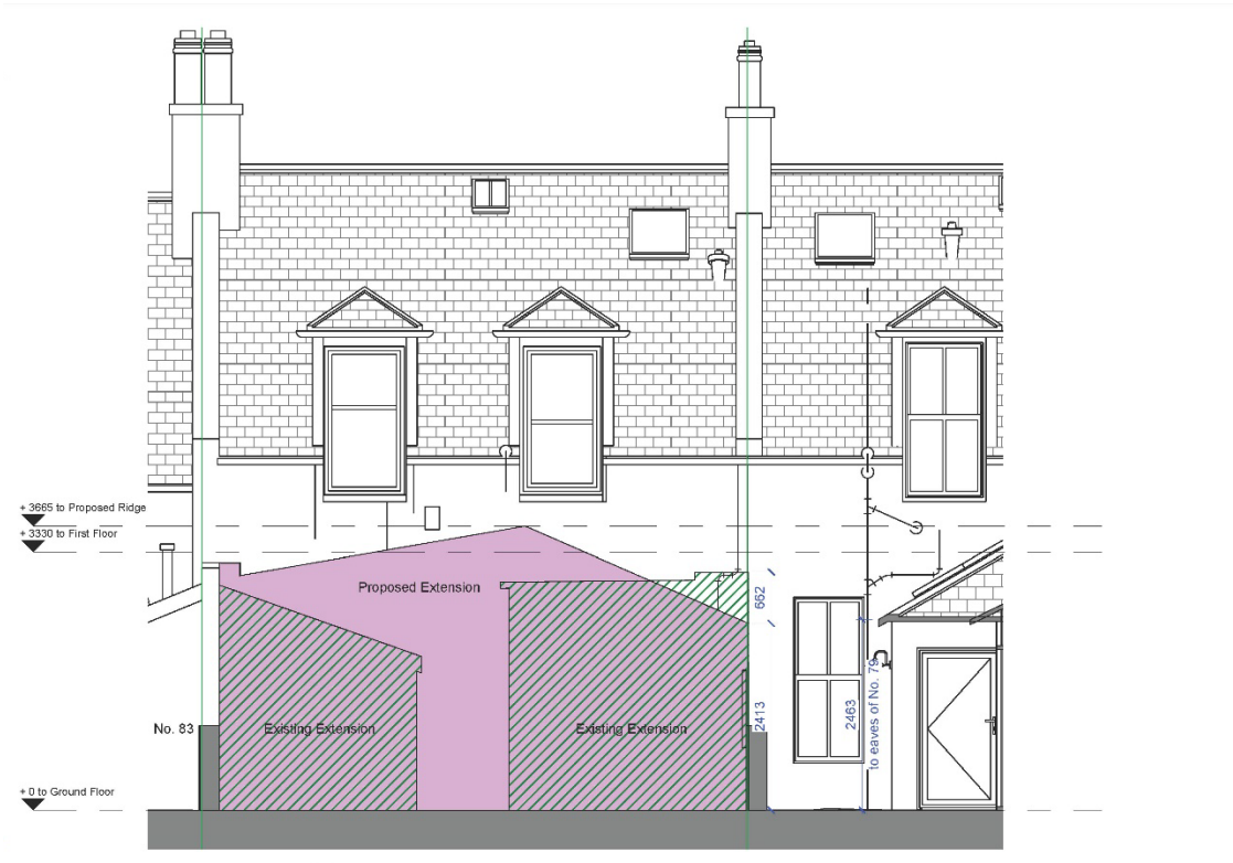
Section 1 Diagram

This shows the eaves reduced in height in relation to the existing.