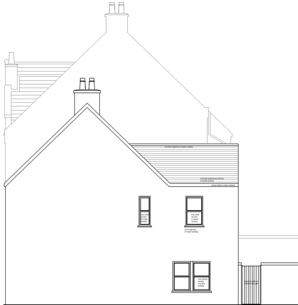
Proposed South-East Elevation