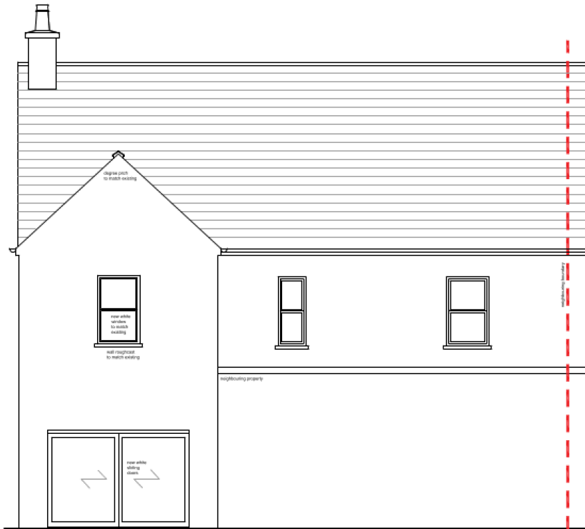
Proposed North-East Elevation