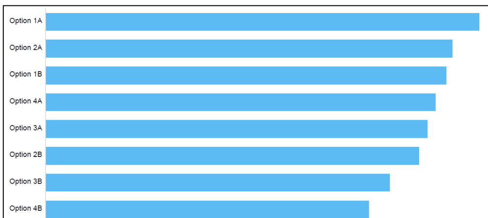
Figure 2: Average Option Rankings

When considering overall average rankings, Option 1A emerged as the most popular option, with a general preference for the smaller options. Those options excluding Denburn Road from the LEZ area were less well received, with 2B, 3B and 4B being the least acceptable options (Figure 2).