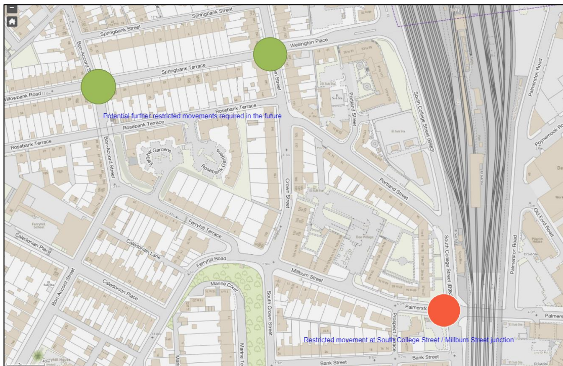
Figure 4: Potential Future Traffic Management requirements

3.1.11A full description of the option appraisal, sifting and development process is contained within the second interim NLEF Report – the full report is available as Appendix 1, while Appendix 2 forms an Executive Summary. Appendix 5 comprises the LEZ Option Testing Report. A plan of the final preferred LEZ option is included as Appendix 6, along with a schedule of streets that fall within the proposed LEZ boundary. An initial Emissions Analysis Report is included as Appendix 10, and will be developed further as we move towards final scheme proposals.