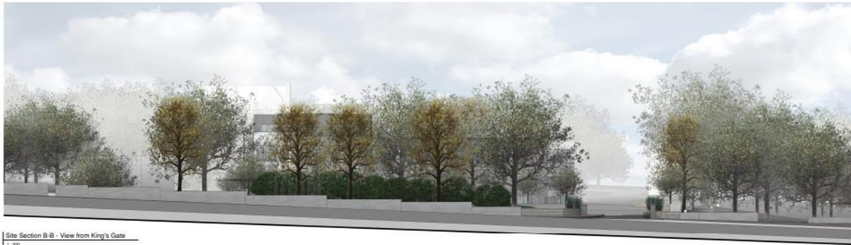
2 Site Section B-B - View from King's Gate 1:200