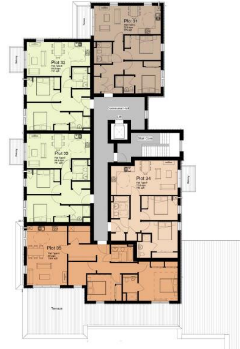
Proposed Third Floor Plan