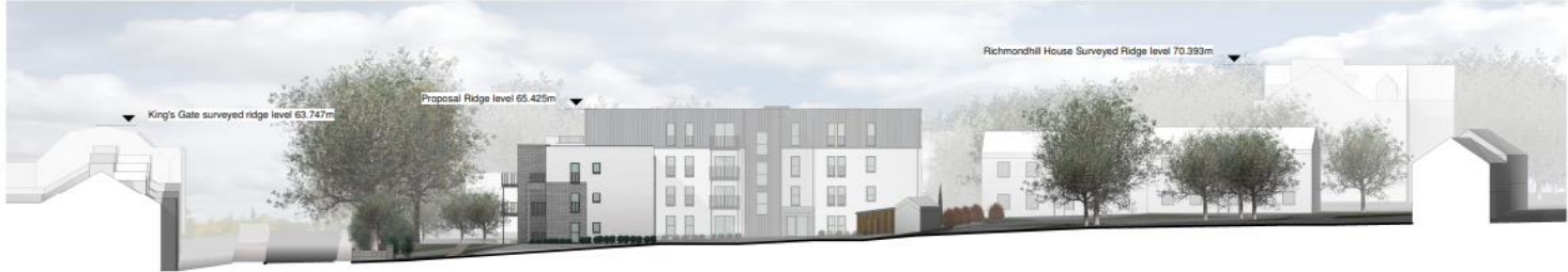
Site Section A-A 1:200