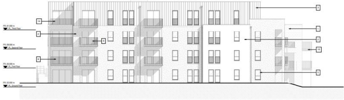
4 | Proposed Side Elevation 2 1 : 100