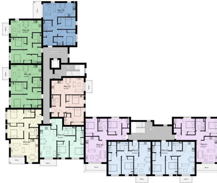
Proposed First - Second Floor Plan