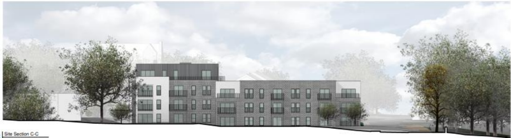
Site Section C-C 1:200