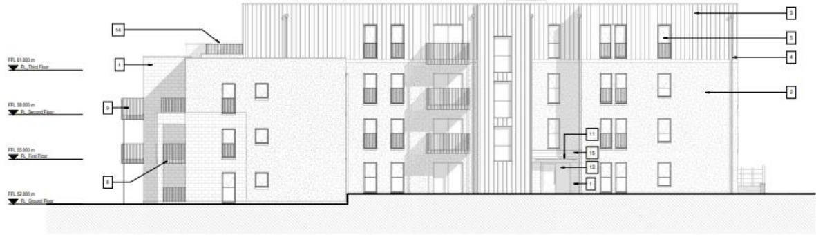
3 | Proposed Side Elevation 1 1 : 100