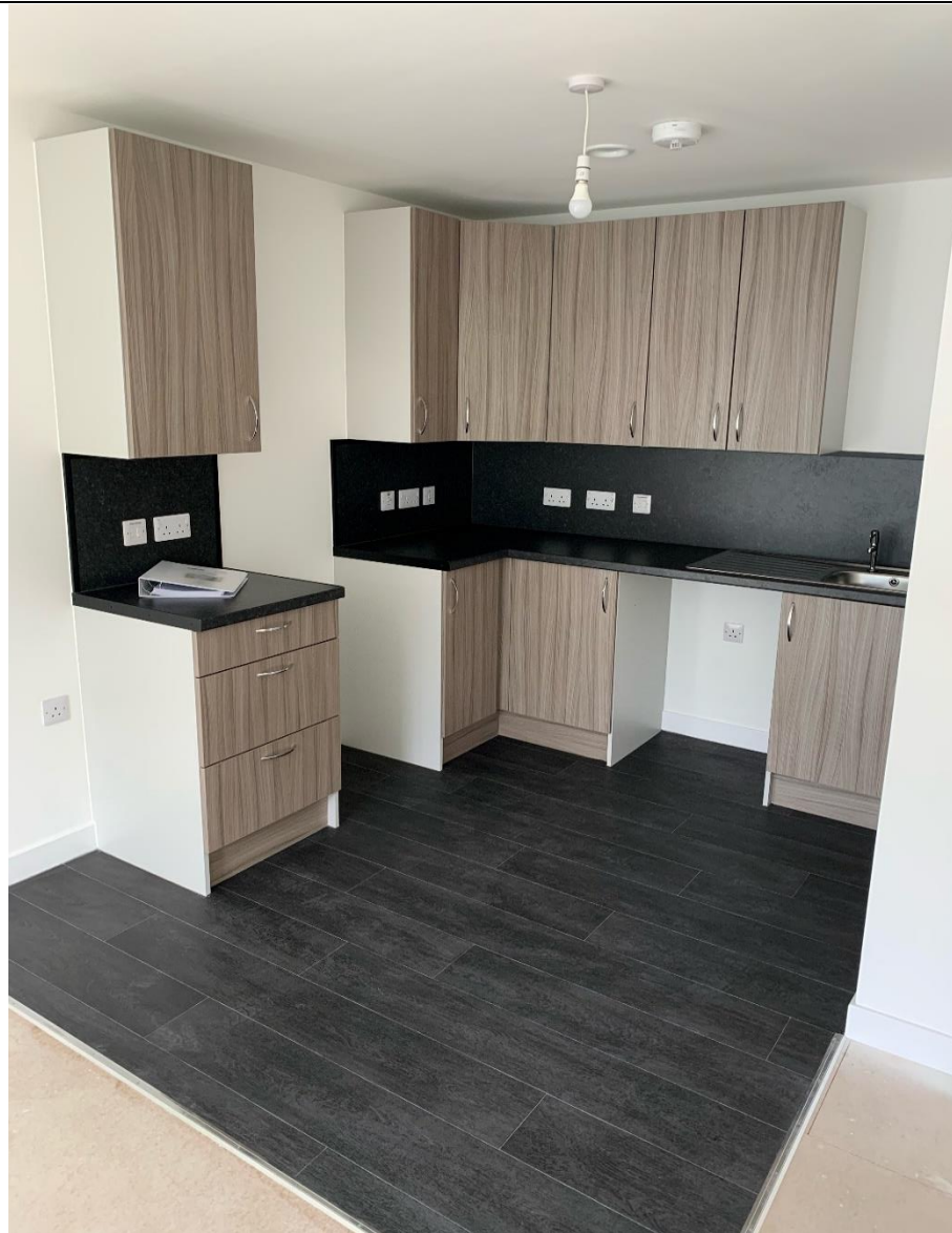
Block 3 Kitchen