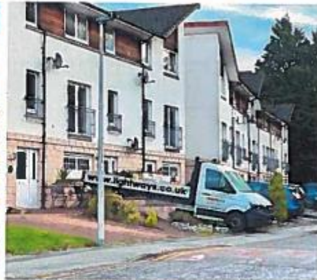
46 Shaw Road

If you require further details on the above, please contact me ref. details supplied above.