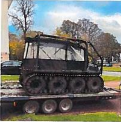
54 Shaw Road

Again, see below photos of commercial vehicle parking: