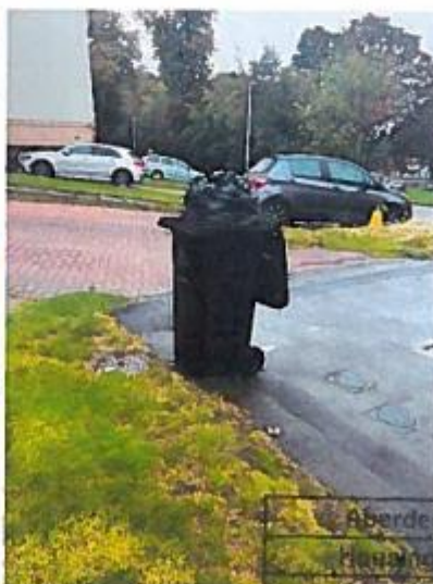
54 Shaw Road 8 Oct 23