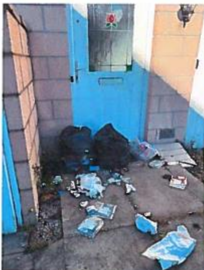
54 Shaw Road 22 Oct 23

I've supplied the bin schedule to properties management company on a number of occasions but they are still unable to manage the situation. Please find below photos of examples of this poor management.