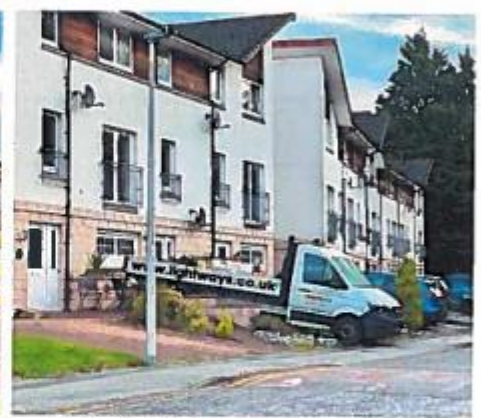
54 Shaw Road