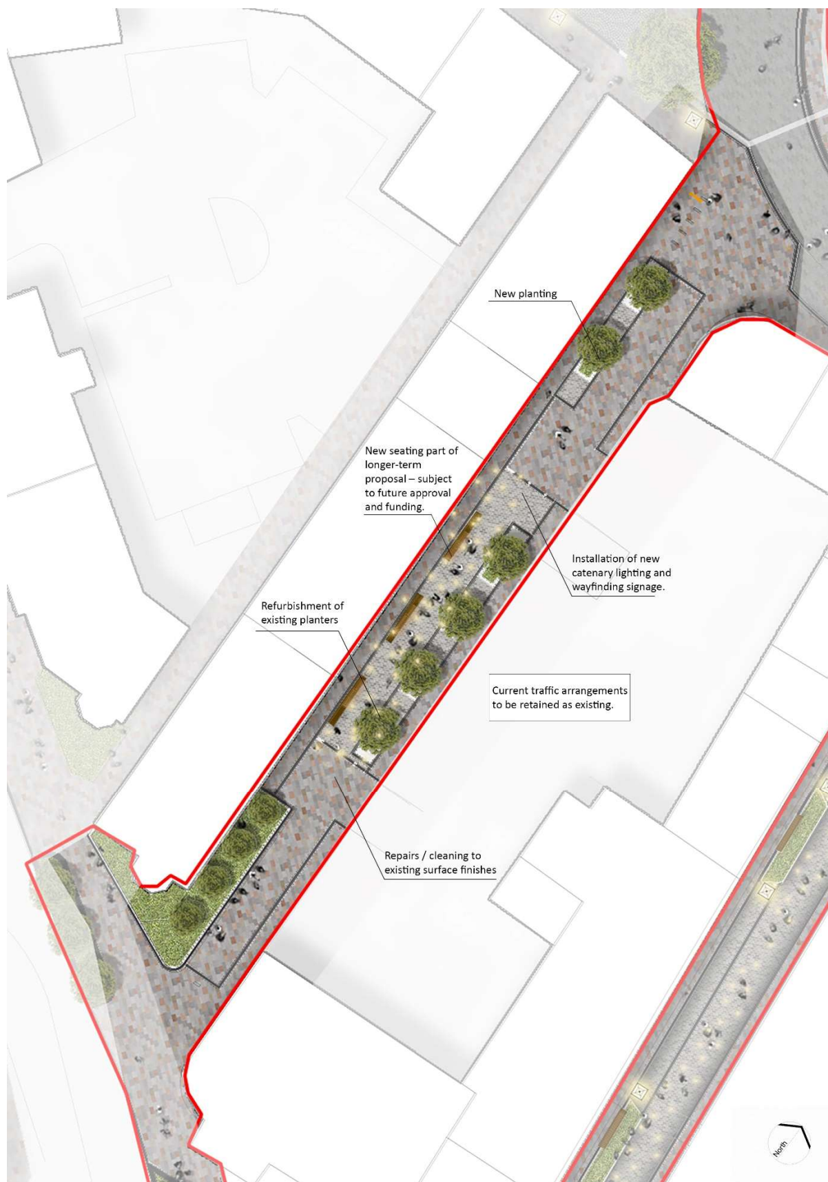
Carmelite Street (North) Proposals

In considering all of the above, this Summary of Outline Proposals is put forward on the basis of developing the design proposals for Carmelite Street (North).