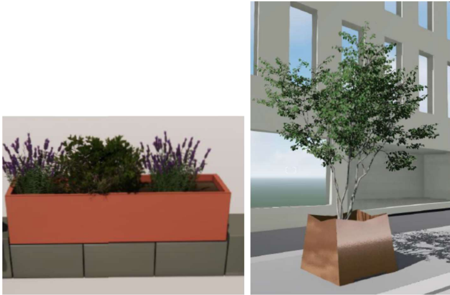
Union Street Central Streetscaping Design References

Works to be undertaken to repair and refurbish the existing planters, maintaining their current location. Design of the planters will be developed with reference to the fixed planter designs proposed for the plaza border around the Green as part of the new Market project and also from the moveable planters being installed in Union Street Central to provide consistency in appearance. Examples of these design references for Market and Union Street Central are shown below to provide some context pending design development.